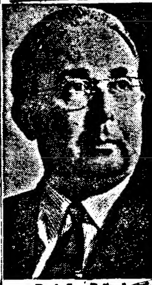
Prof. Leo Szilard